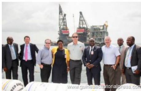
The delegation on board the Red Eagle vessel, with the new platform in the background.

B3 is the biggest platform of all those installed in our waters, and is a project between the Ministry of Mines, Industry, and Energy, and the American oil company, Marathon Oil.